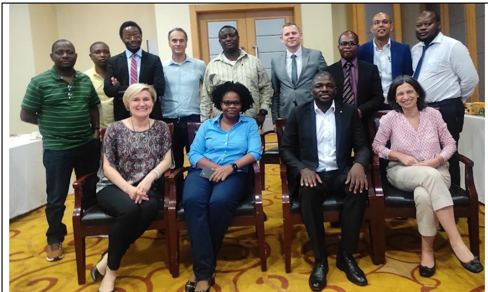
Fig: Participants in the Malawi national ID ecosystem