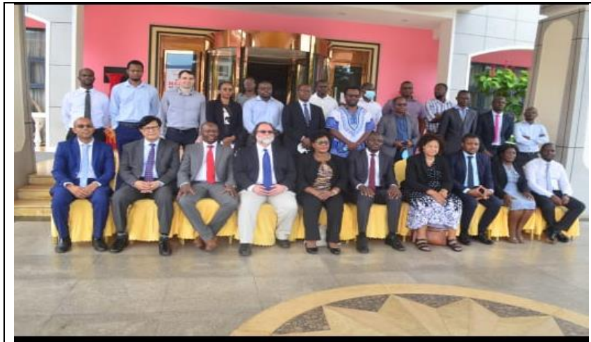
Fig: Participants in the CRVS TWG meeting